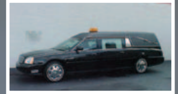
2003 Cadillac Superior Hearse. Black with Black Leather