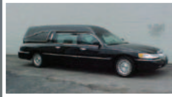
2000 Lincoln Eagle Hearse. Black with Black Leather

SERVING THE FUNERAL INDUSTRY FOR OVER 40 YEARS