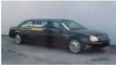
2004 Cadillac Federal 6-Door Limo. Black with Black Leather. Call today for details!!