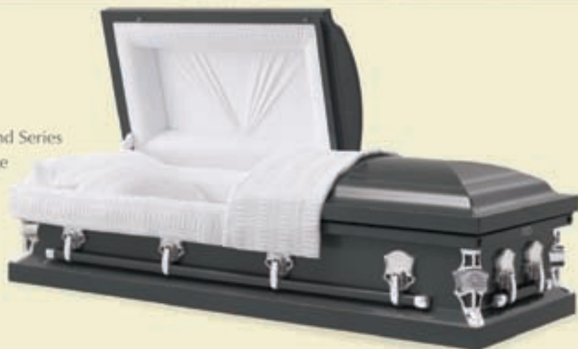
Heartland Series 20 gauge

V-Ray- Available in Orchid, Almond, Pewter & Metallic Blue