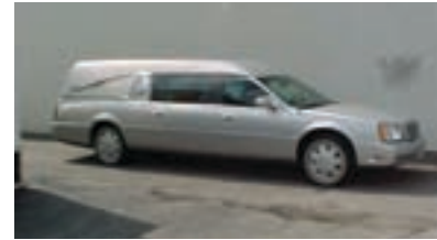
2002 Cadillac Superior Hearse. Silver with Blue Leather. Call today for details!!